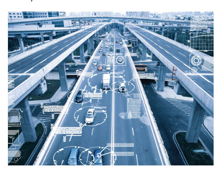
Enabling observations of road conditions through image recognition

The future of mobility is connectivity and automation, and many of these new vehicles are fully electric. Automated vehicles require a complex sensor fusion of technologies to perceive and adapt to their surrounding environment. Simulation environments with realistic weather conditions are pivotal in understanding how weather affects automated vehicles and to develop solutions to overcome these challenges. Automated vehicles also require greater connectivity to navigate their environment. Detailed understanding of weather impacts is necessary, not only on vehicle operation, but also on attenuation of transmitted information and fidelity of sensor data. Advancements in artificial intelligence modeling allow leveraging of the infrastructure to further support the deployment of new vehicle technologies, such as image recognition from roadside cameras leading towards a higher density of observations available for transmission to the vehicle. And with increased computational load, these vehicles will require pinpoint guidance on battery performance in a variety of weather conditions to relieve range anxiety.